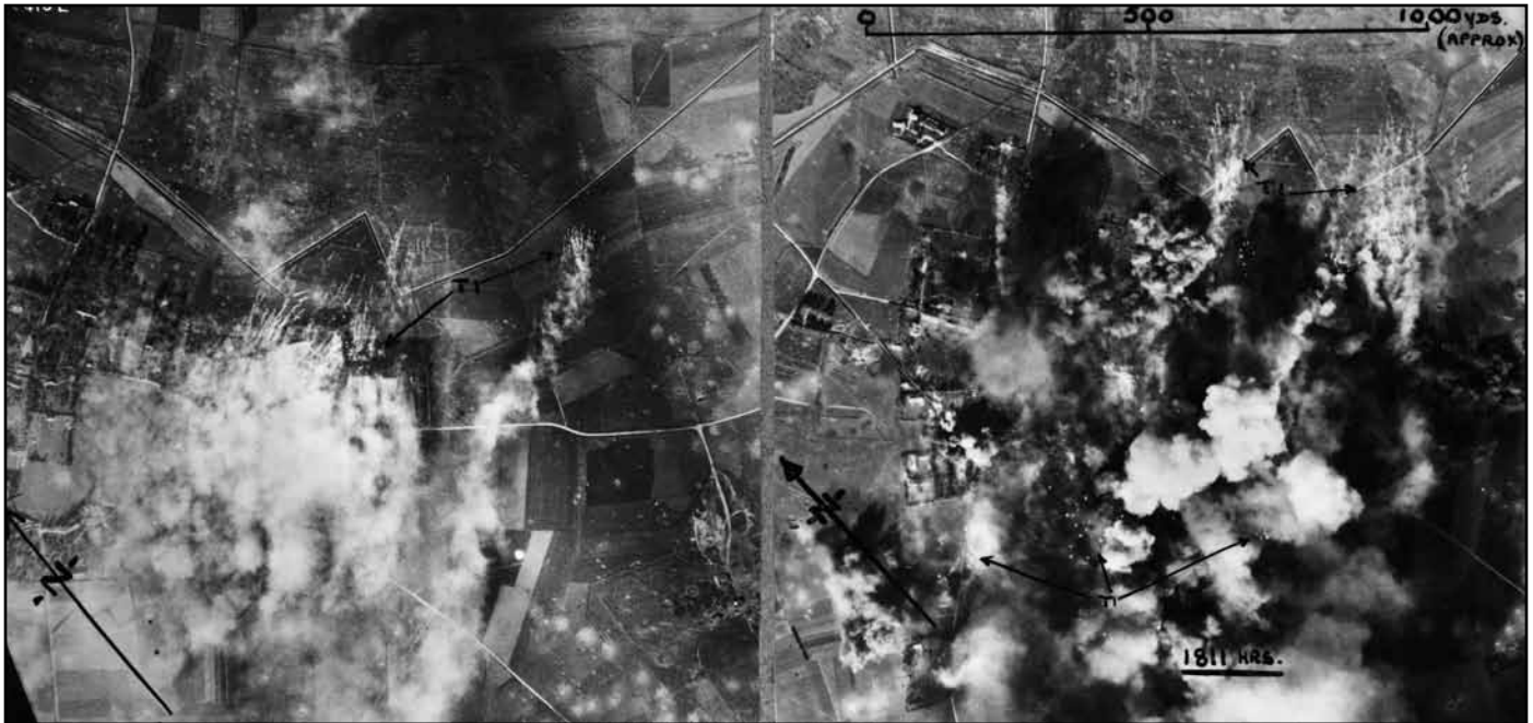
Above: Daylight attack on the area north of Le Havre on 10 September 1944. The anti-tank ditch is visible crossing at the top. The image on the left shows the target indicators (T.I.) while the image on the right shows the later bombing concentration.

statements they did make I should not have discussed the matter any further; in the circumstances I felt, before returning, that it would be as well to make some enquires of my own. It was as well I did. Subsequently I gathered an entirely different viewpoint.